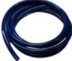
PF2083 – 3/8" Abrasive Tube (8 feet)