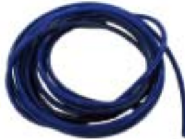
MB1233 – 1/4" Abrasive Tube (6 feet)