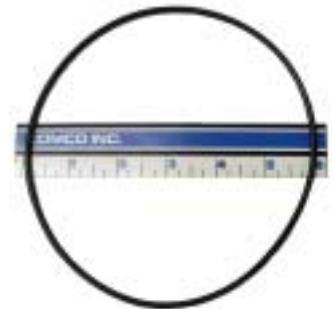
ST5495 – O-ring (1) (5.859ID x .139THK)