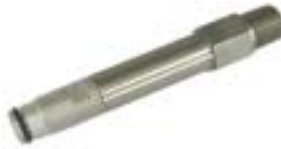
PF2040 – Modulator Housing Assembly (1)