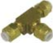
ST4015 – 1/4T Brass Tee (1)