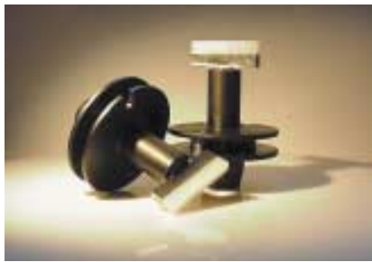
Special RT configurations are possible beside the above standard designs. Example of Delrin RT tip on MC26 Shank