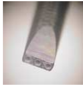
Execution with 3 vacuum holes