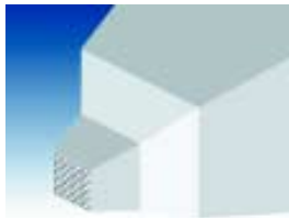
SQUARE WAFFLE FOOT