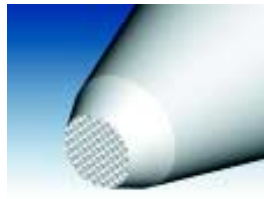
ROUND WAFFLE FOOT