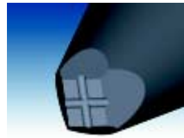
DOUBLE CROSS GROOVE 7000 STYLE