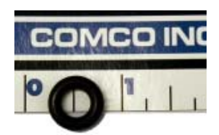
ST5496 – O-ring (2) (.296ID x .139THK)