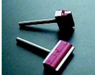
Flexible PL Tips