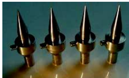
1059D Shank Stamping Tool