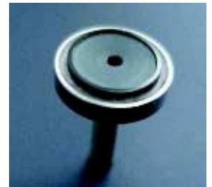
Flexible HTV cup