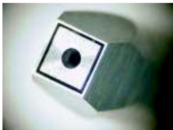
Peripheral Vacuum RT