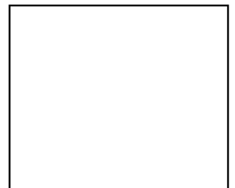
Your next Tool