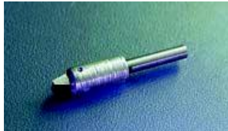
Flexible RT Tip