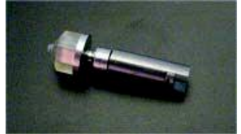
Spring Loaded Tool Holder