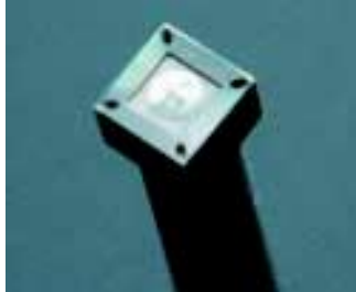
Corners Vacuum Channels

Beside the common standard tools, SPT is developing different solutions to meet special and challenging applications. We invest time and resources and work together with our customer to satisfy his needs.