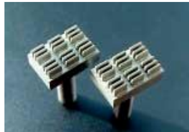
Special Matrix Stamping Tool