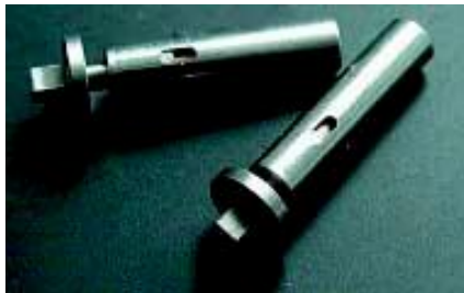
Spring Loaded Tool Holder